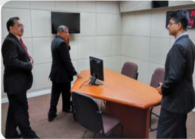
With MACC Malaysia