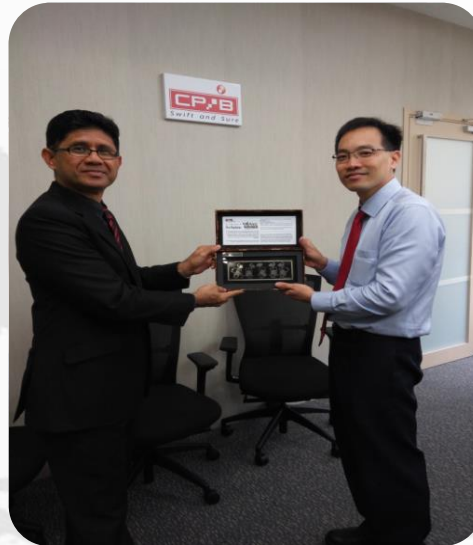
With CPIB Singapore