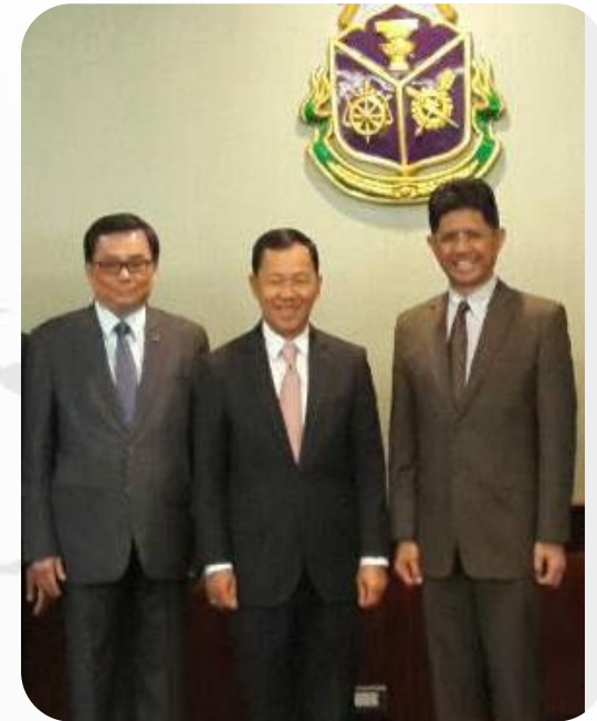
With NACC Thailand