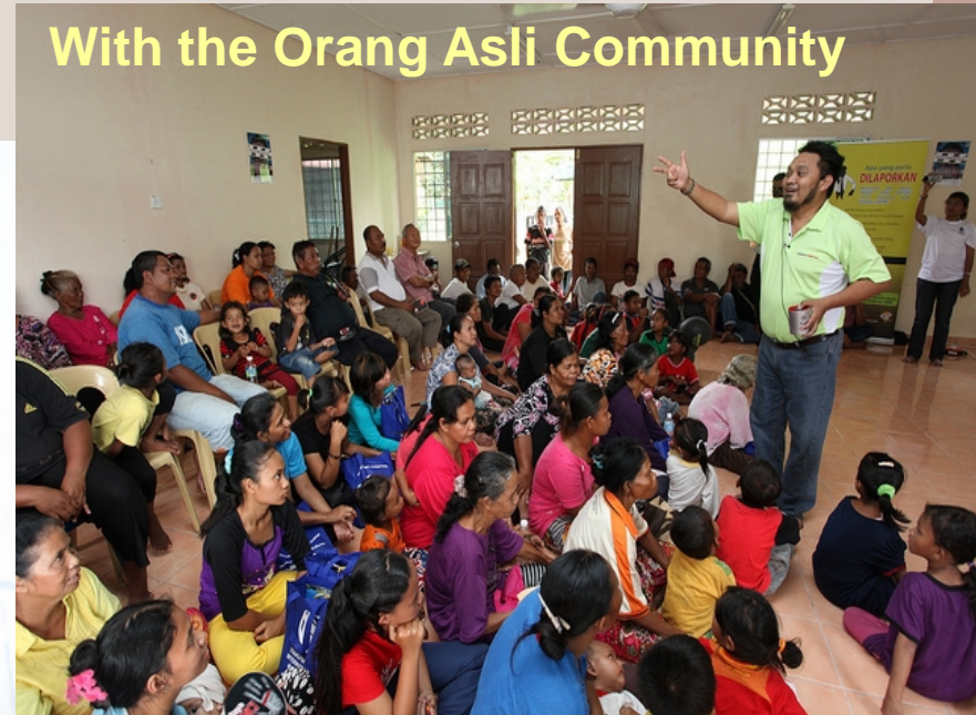
With the Orang Asli Community