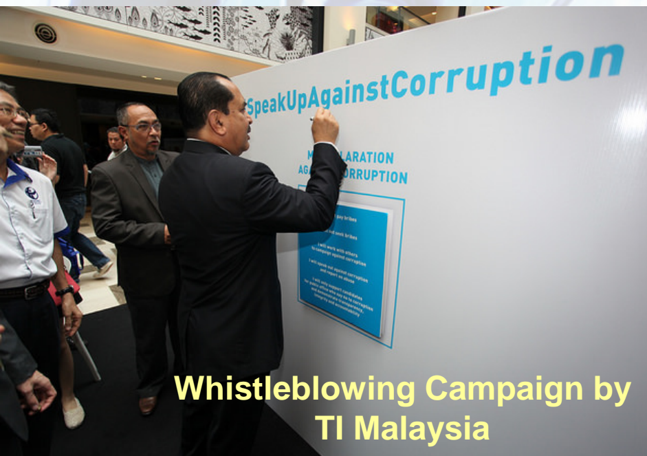
Whistleblowing Campaign by TI Malaysia