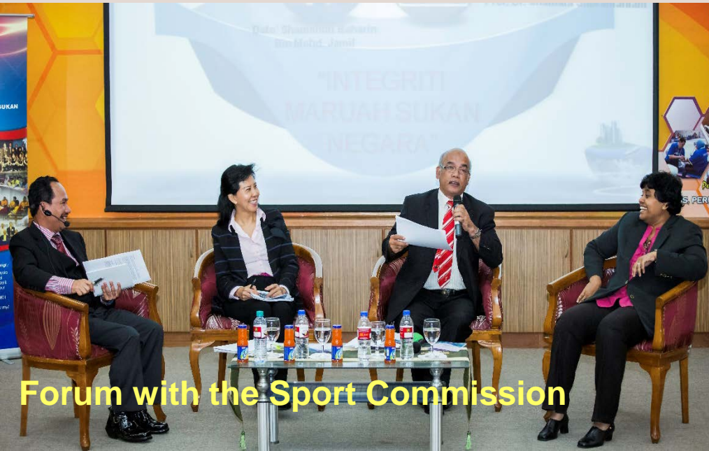
Forum with the Sport Commission